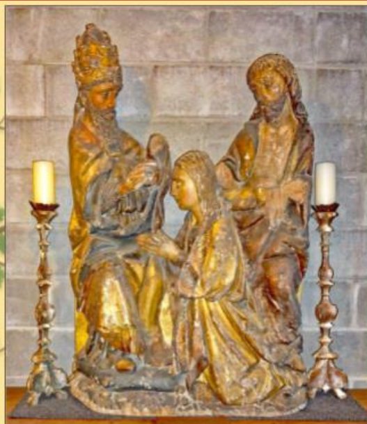
Coronation of the Virgin Mary Sculpture

This 15th-century oak sculpture depicts Jesus on the right and Mary (kneeling in the center) being crowned by God (on the left) as the Queen of Heaven for having been chosen by God for the divine motherhood.