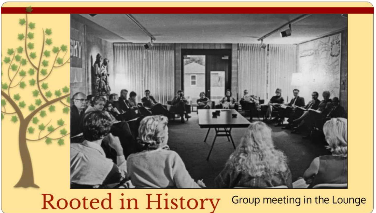
Rooted in History Group meeting in the Lounge

Sunday: 1 Kgs 19:4-8; Eph 4:30-5:2; Jn 6:41-51. Monday: Dt 10:12-22; Mt 17:22-27. Tuesday: Cor 9:6-10; Jn 12:24-26. Wednesday: Dt 34:1-12; Mt 18:15-20 see 619: Phil 3:8-14; Mt 19:27-29. Thursday: Jos 3:7-10a, 11, 13-17; Mt 18:21-19:1. Friday: Jos 24:1-13; Mt 19:3-12. Saturday: Jos 24:14-29; Mt 19:13-15 see 620A: Wis 3:1-9 or 1 Jn 3:14-18; Jn 15:12-16. Sunday: The Assumption of the Blessed Virgin Mary Rv 11:19a; 12:1-6a, 10ab; Cor 15:20-27; Lk 1:39-56.