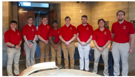
Knights of Columbus

Other student-led chaplaincy groups, the Theology and Contemporary Issues Discussion Group, Men's Small Group, and RPI Athlete's Fellowship, are thriving with renewed interest and energy.