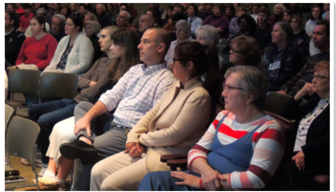
Families gather at the Chapel + Cultural Center.

Special thanks to the student members of the RPI Chaplaincy, including those from the Knights of Columbus Council