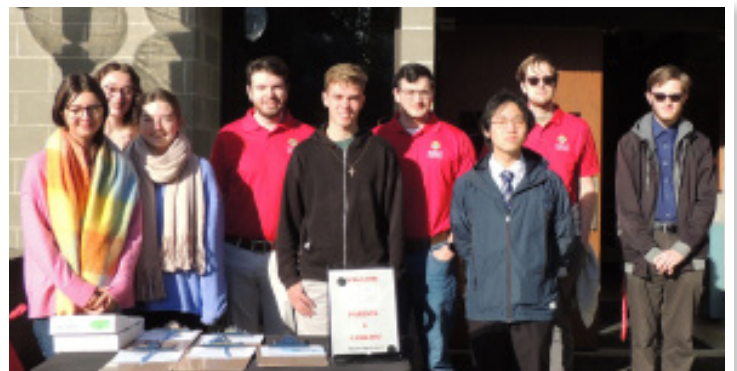
RPI Chaplaincy students assisting with registration.

We're so grateful for your help and we look forward to welcoming families back next year!