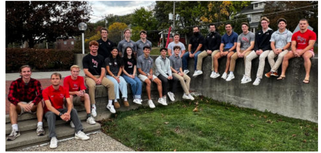
RPI Athlete's Fellowship