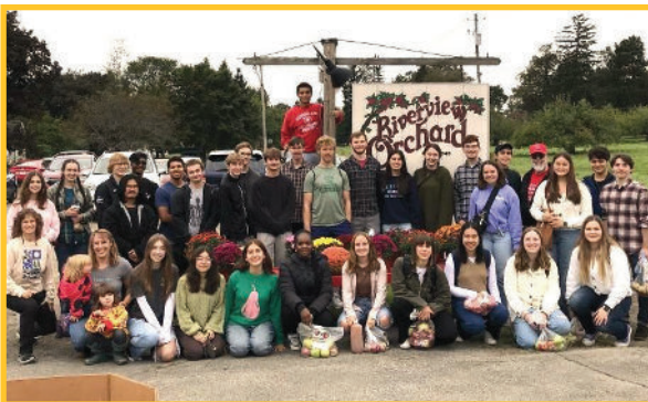
Newman hosted an Apple picking trip and pie making this fall!