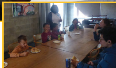
Wine & Cheese Reception