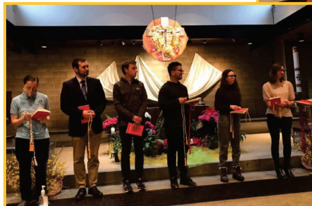
Class of '23 Students receiving their cords at the Baccalaureate Mass