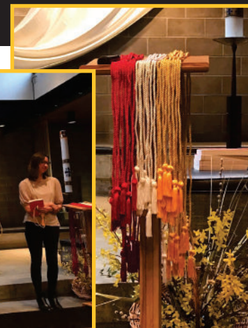
Red, white, gold Honor Cords