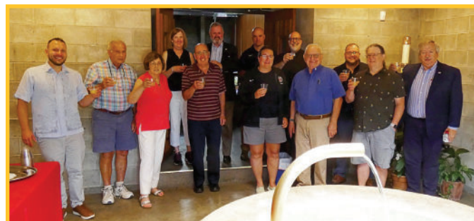
The RNF Trustees toasting the installation of the new doors!