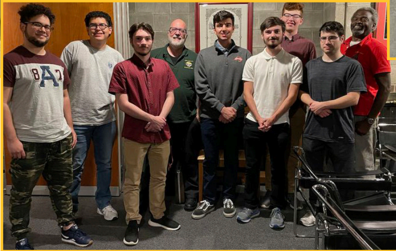
The Knights of Columbus meeting in the C+CC lounge weekly on Thursday evenings

Check out our new website: RensselaerNewman.org