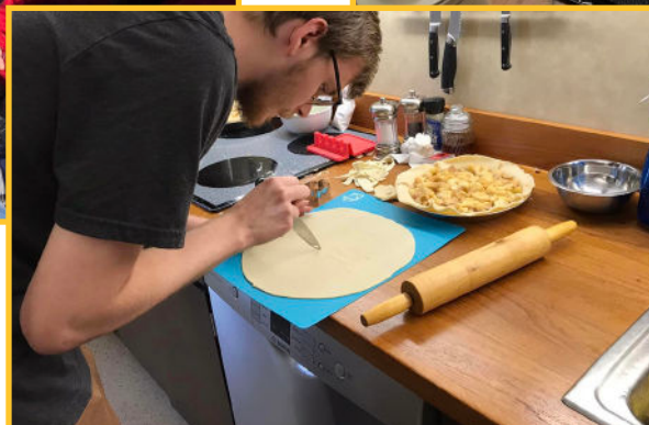
Students preparing and baking apple pies at the Chaplain's Residence