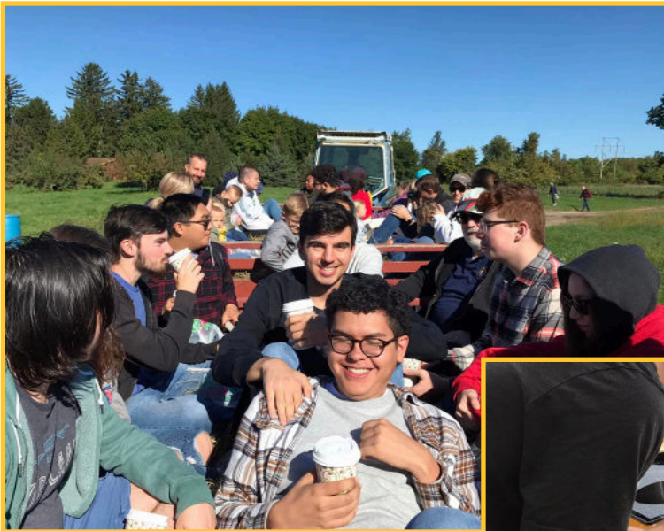
Newman Fellowship students taking a wagon ride at the apple orchard