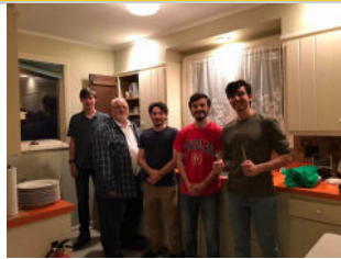
The Knights cooking dinner on Tuesday for Newman dinner.