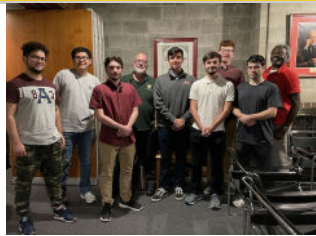
Knights reconnecting with Alumni to grow the RPI council.