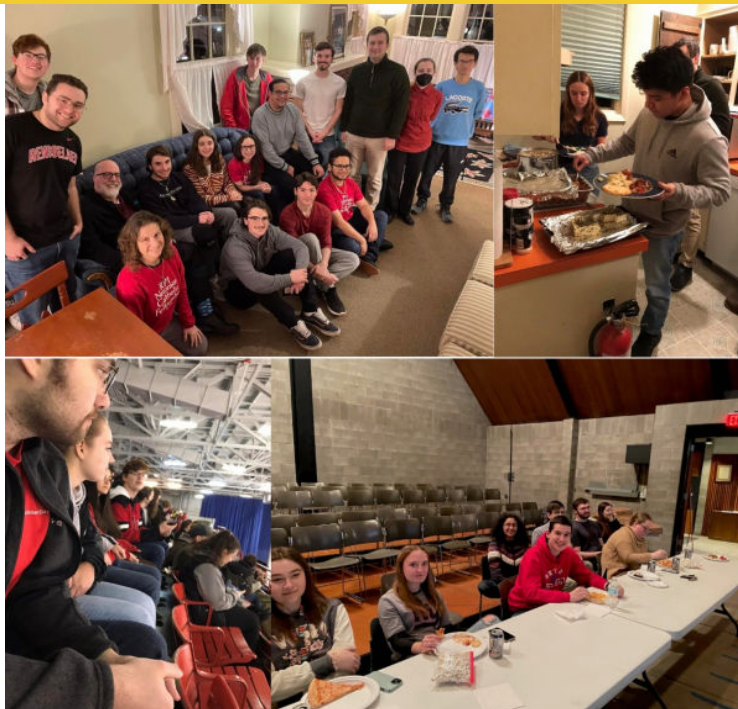
The spring semester has been wonderful for the Newman Catholic Fellowship!